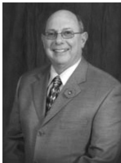
Gary St. Onge Mayor City of Estevan